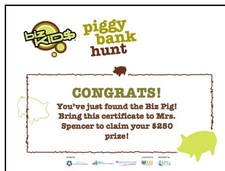
Sample Secret Message:

Questions? Feedback? Email us at piggyhunt@bizkids.com